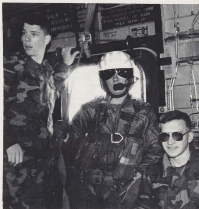
Aspiring officers relax on a helicopter ride around Quantico.

The MOFT takes place annually, usually not to the same base twice in a two-year period. The last two trips have been to Quantico; and before that to Camp Pendleton, near San Diego, CA., which is the desired location next year.