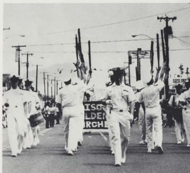
The Drum and Bugle Corps and the Drill Team perform "The Alamo" in front of a wild crowd.